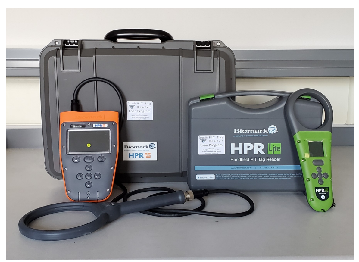
Figure 1. HPR Plus and HPR Lite PIT tag readers.

BPA has requested that Columbia Basin Fish and Wildlife Programs discontinue use of Destron-Fearing FS2001 portable PIT tag readers as they are no longer supported by Biomark and may pose a safety hazard (see news item from June 11, 2018).