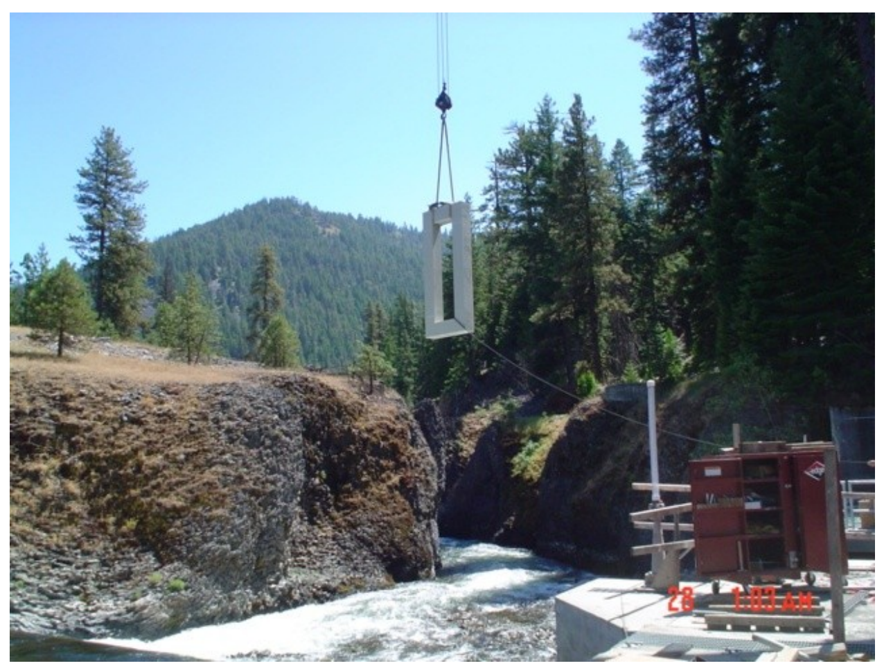
Figure 1. Castile Falls Fishway PIT tag system under construction.

ALAN BROWER (PTAGIS Kennewick Field Office)