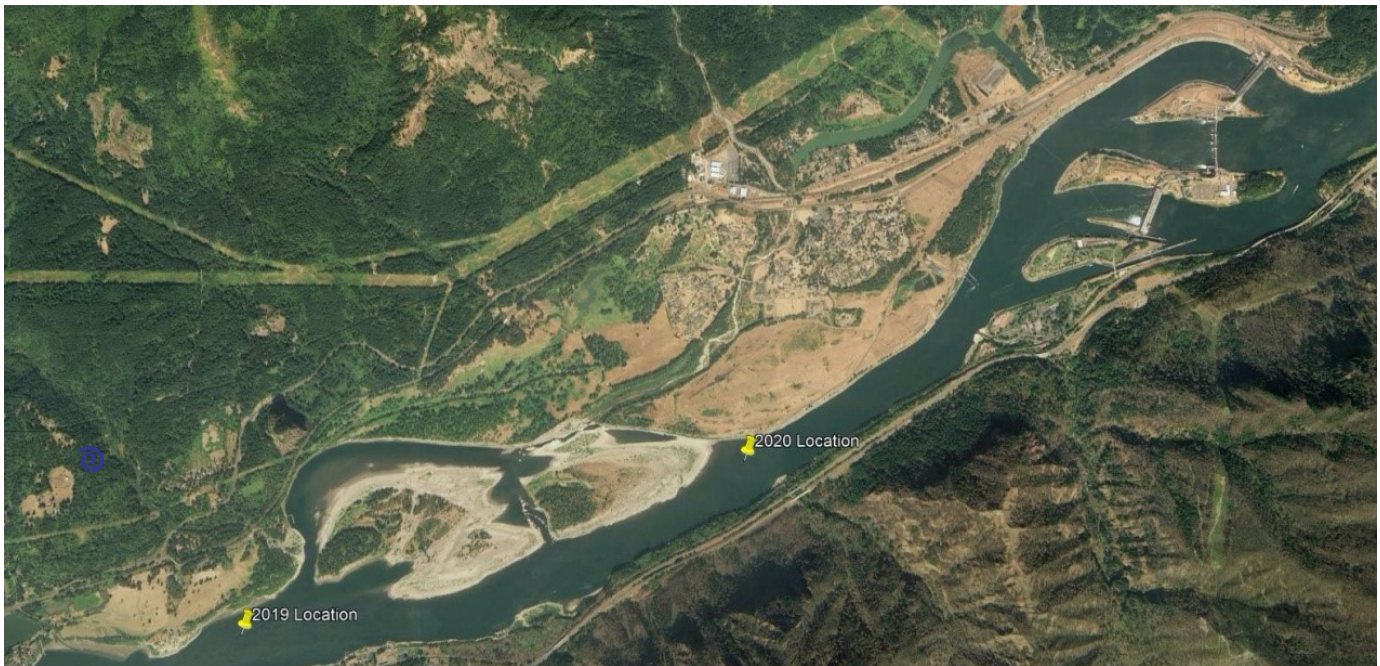
Figure 2. PIT barge deployment locations in 2019 and 2020.

Deployment dates in 2019 were less than ideal for fish detection as we missed the majority of PIT-tagged juvenile salmonid outmigration due to a government shutdown. However, tests were completed to demonstrate how debris loads and higher flow conditions effected the barge performance and maintenance requirements. One of the novel features of the PIT antenna barge is the ability of the antenna fins to autonomously raise up and allow debris to be shed under the barge ( seen here ).