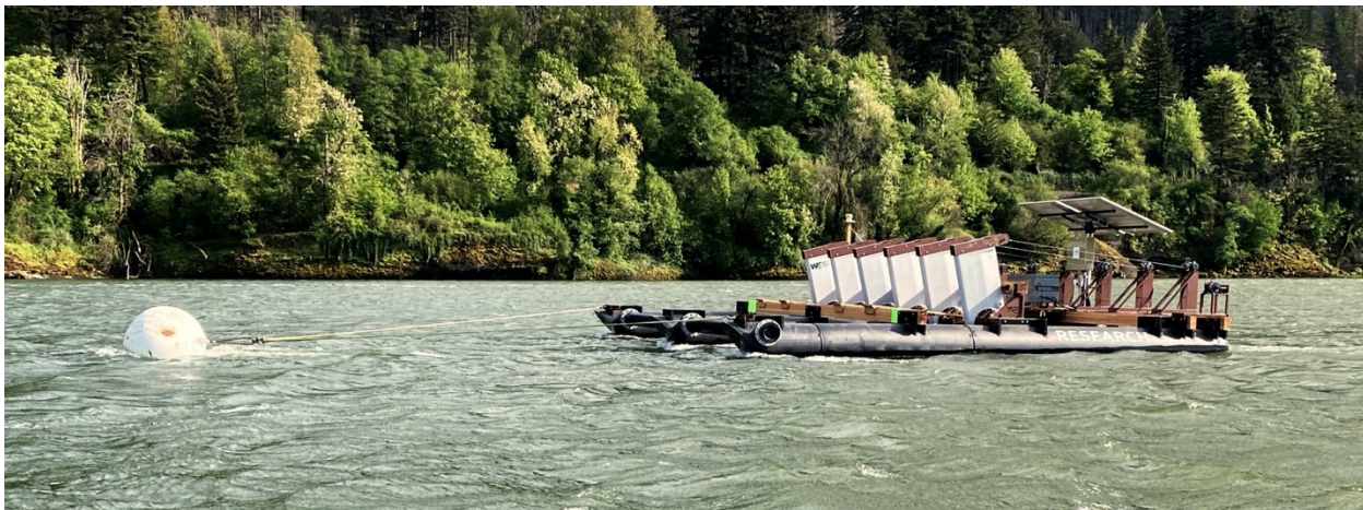
Figure 1. PIT barge as deployed in 2020.

MATTHEW NESBIT & GABRIEL BROOKS (NOAA Fisheries)